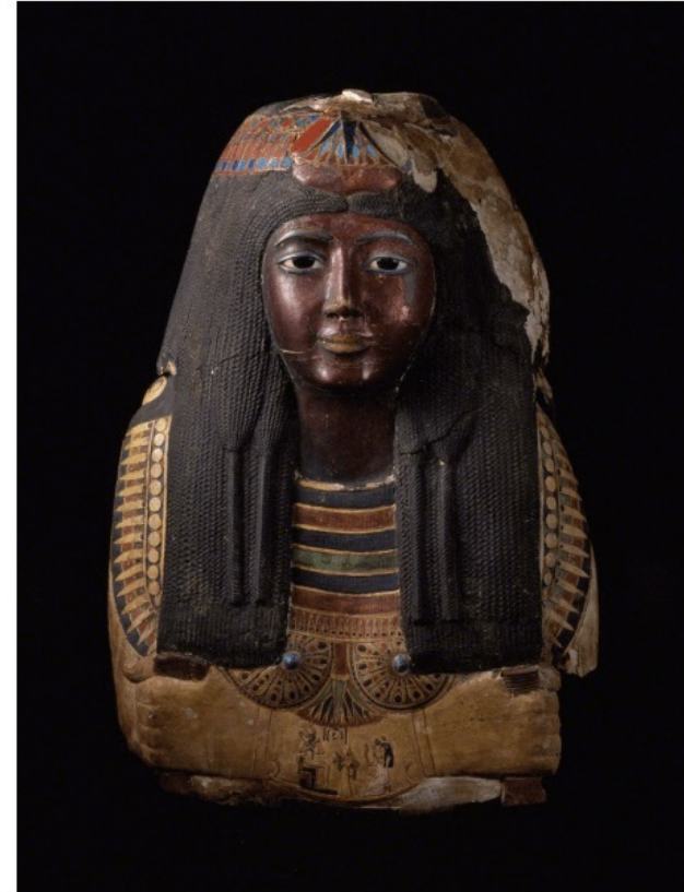
Mummy Mask of the Lady Ka-nefer-nefer

ONE FINE ARTS DRIVE, FOREST PARK, ST. LOUIS, MO 63110-1380 TELEPHONE: 314.721.0072